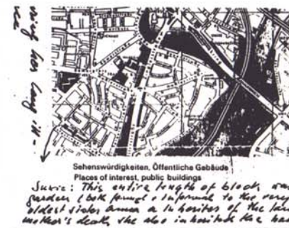
From Kunstmuseum Bern, Switzerland catalogue of "Alles und Noch Viel Mehr", 1985