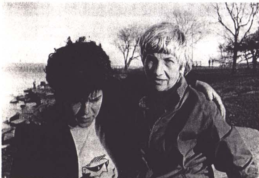
The Ties that Bind, 1984.

Memory is a tricky beast, and moreso when one is forced by a persistent daughter to recall an experience as traumatic as a war (and one as fraught with guilt and silence as this war). I learned a new patience in talking with my mother, when I realized that the truth sometimes comes out very slowly, in small batches, and that doesn't make it less of a truth. I also did a lot of fact-checking with my father, who had heard about the same events soon after they occurred. It made me