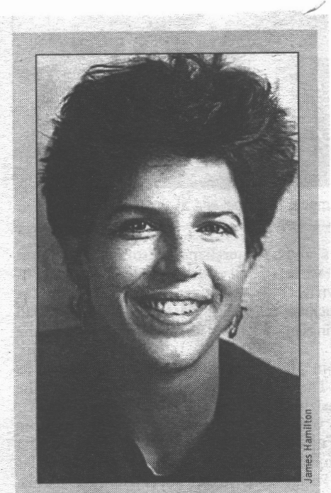
Filmmaker Su Friedrich

Tickets are $7 and available at the door. MadCat Women's International Film Festival screenings are taking place throughout the month of September at four Bay Area venues: Artists Television Access, San Francisco Art Institute, El Rio and the Pacific Film Archive in Berkeley. For more information, call the Madcat Hotline at (415) 436-9523, or visit www.somaglow.com/madcat.